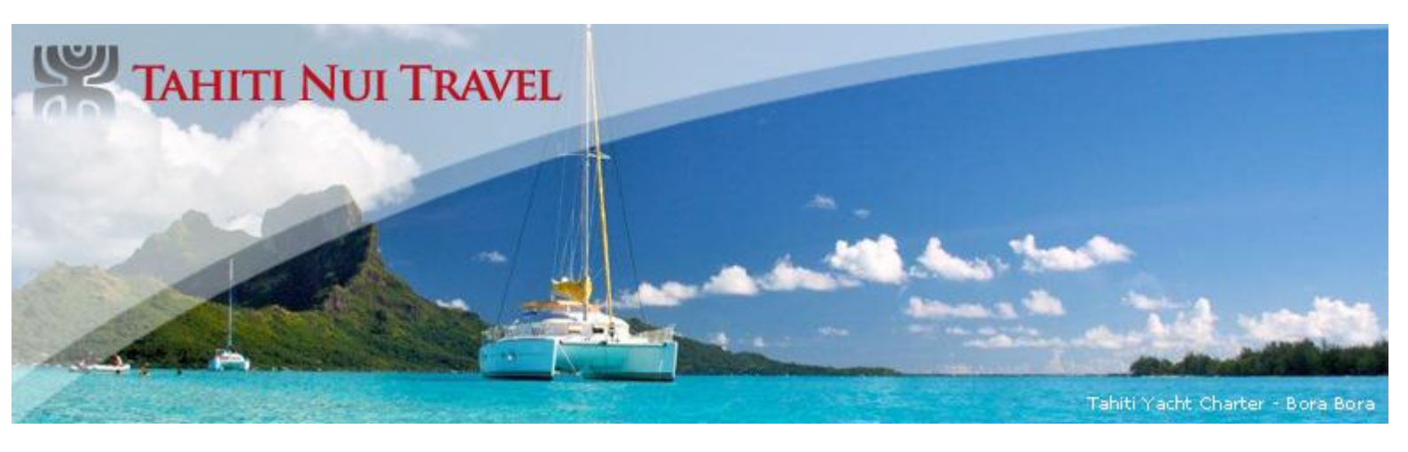
Flash News - March 26th, 2014